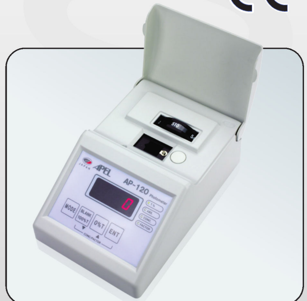
Cover prevents light penetration from outside.